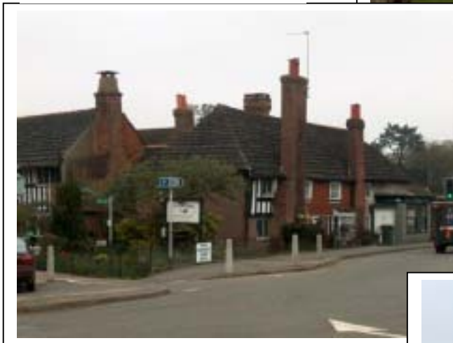
St Peter's Cottage, circa 16 th century was once one property, but has been divided into three properties now, one housing a restaurant.