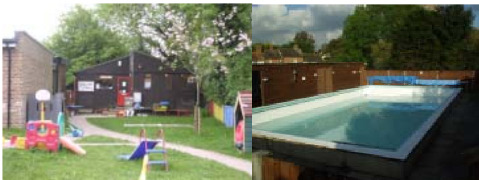
Pictures of St Peter's CE (Aided) Primary School and Country Mice Pre-School.