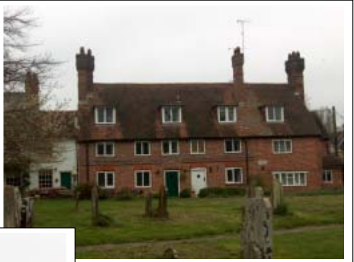
Margaret Cottages on Church Path, circa 17 th century.

The oldest part of the present church is the chancel, which is mostly C13 th and has been dated to the time of Edward I (1272 - 1307).