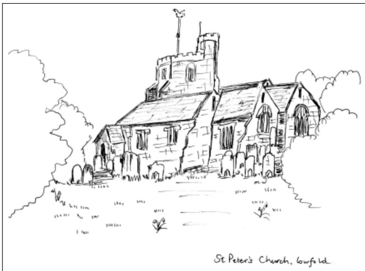
Cover of the Cowfold Parish Questionnaire

The Steering Group kick-started the process after receiving the questionnaire results by inviting all those respondents who said they would like to be more involved to attend the next Steering Group meeting. The enlarged Steering Group worked on the action plans, resulting in this document. This Parish Plan was endorsed by Cowfold Parish Council on 10 April 2006.